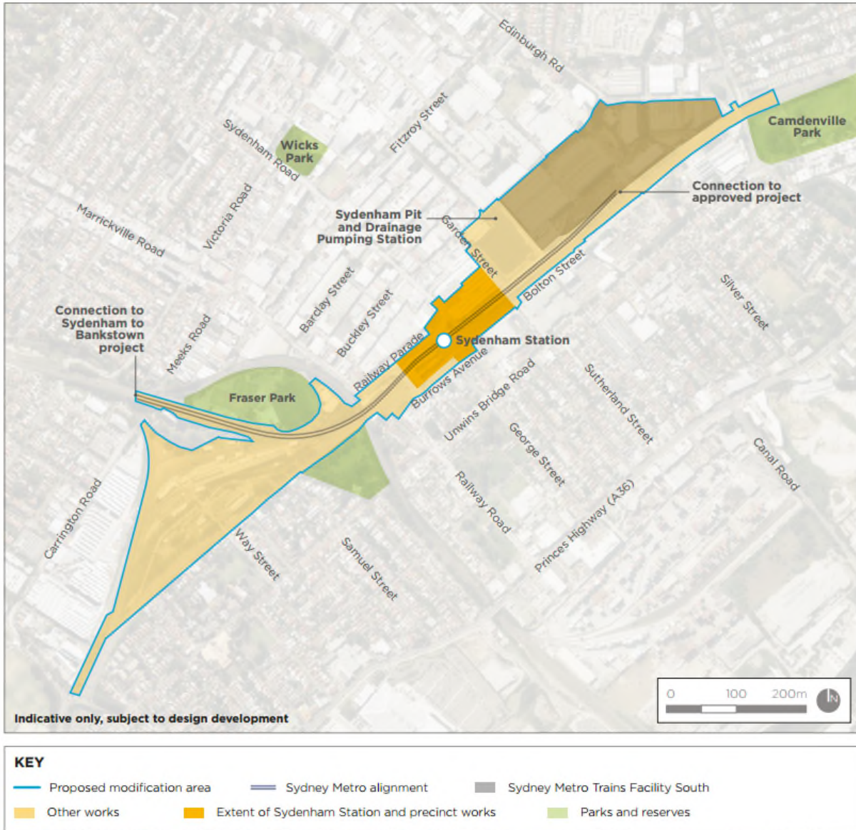
Figure 1 – Sydenham Metro upgrade Project Site

The SMu work location and site layout is highlighted in Figure 1 below