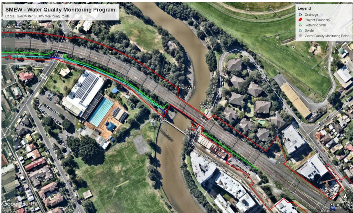
Figure 1 - Surface Water Monitoring Locations

The locations identified for surface water monitoring are the only locations that generally offer safe access. There are several drainage outlets between the upstream and downstream sampling points on both sides of the Cooks River.